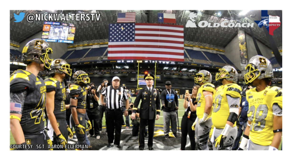
The Old Coach Army All-American Bowl Coverage

High School Star Power. All representing the Stars & Stripes. It's the 2018 U.S. Army All-American Bowl.